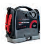
PPS 12V 800 CA