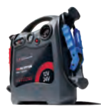
PPS 12/24V 2400/1200 CA